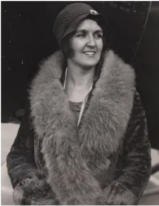
December 9, 1930: Pilot Ruth Nichols poses with the Lockheed Vega airplane, the New Cincinnati, owned by Powel Crosley Jr.