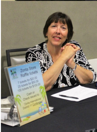
Minding the Store