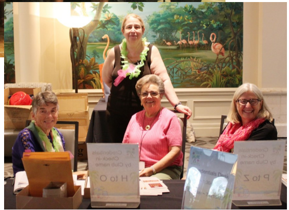
Sign in Please